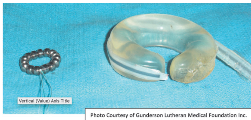
FIG. 3. Comparison of Angelchik device and magnetic sphincter augmentation device.

Rates of erosion and migration complications after magnetic sphincter augmentation compare very favorably with the most common surgical treatment of GERD today, esophagogastric fundoplication, whereby fundoplication-related complications such as suture or pledget erosion, wrap migration with resulting severe anatomic distortion, vagal nerve damage, 25 or failure requiring reoperation occur in up to 20%